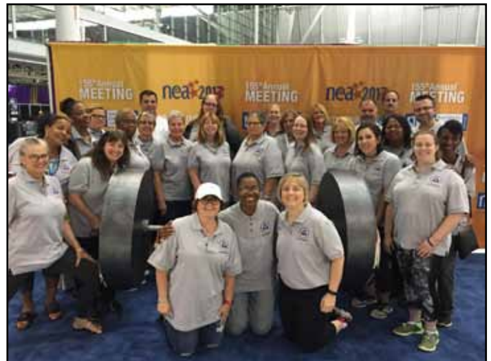
Members of the Monmouth County Education Association attended the NEARA Convention in Boston this past summer.

If I do not have a chance to see you to personally extend good tidings, I wish you and your family a wonderful holiday season and look forward to seeing you in the New Year!